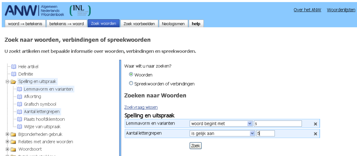
Figure 3. Illustration of search option Features → Words

All search options support the use of wild cards, and the input undergoes some linguistic analysis including stemming and removal of stop words. The results are ranked by relevance, but other sorting options are offered as well.