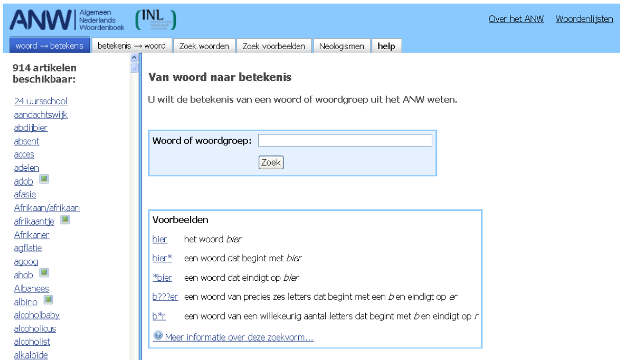
Figure 1. Illustration of the different search options in the user interface